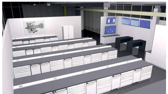
3D render of maintenance workshop concept