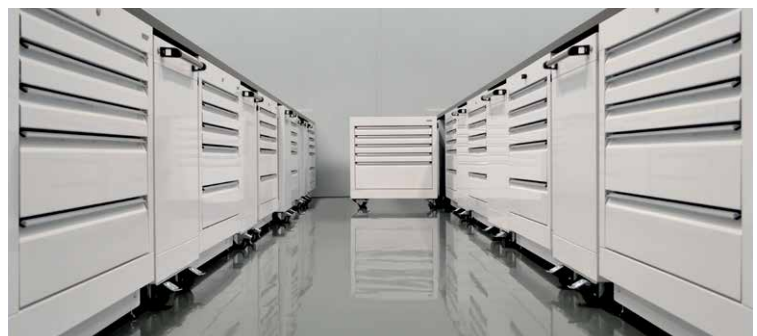
The new workshop for the world-famous aerospace company in Derby

Dura have recently delivered an outstanding workshop solution for one of the most famous names in engineering throughout the world. As a global leader in industrial technology and a pioneer of innovation, they set the benchmark for excellence and are an integral part of shaping the world we live in today.