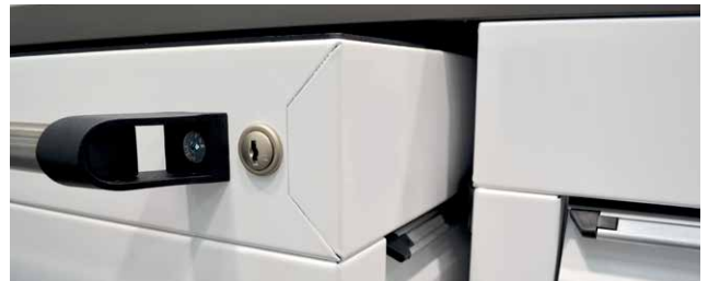
Integrated mobile cabinets allocated to each engineer