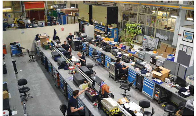
The Maintenance Workshop before the Dura installation