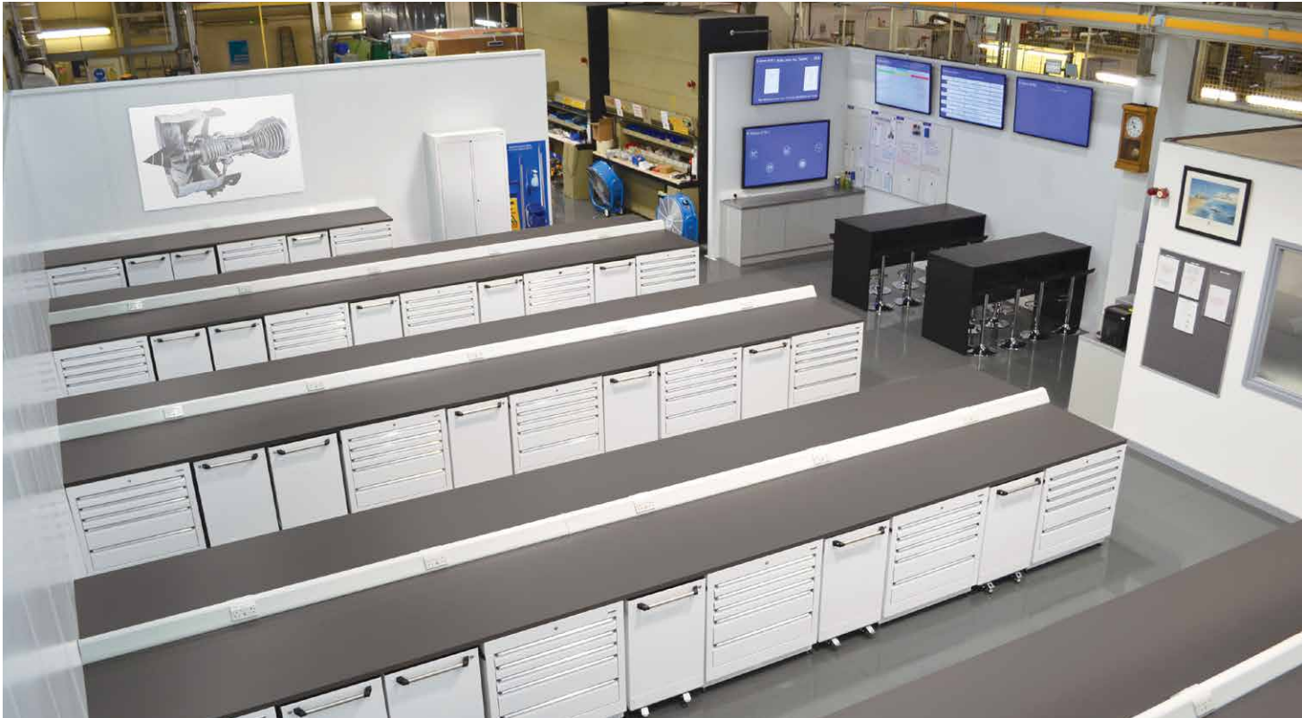
The transformed Workshop incorporating additional bays to accommodate 38 engineers