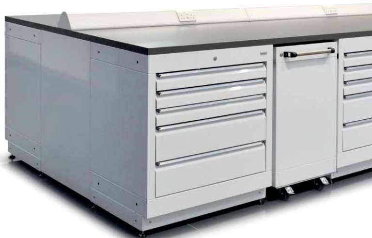
Continuous worktops with integrated power points