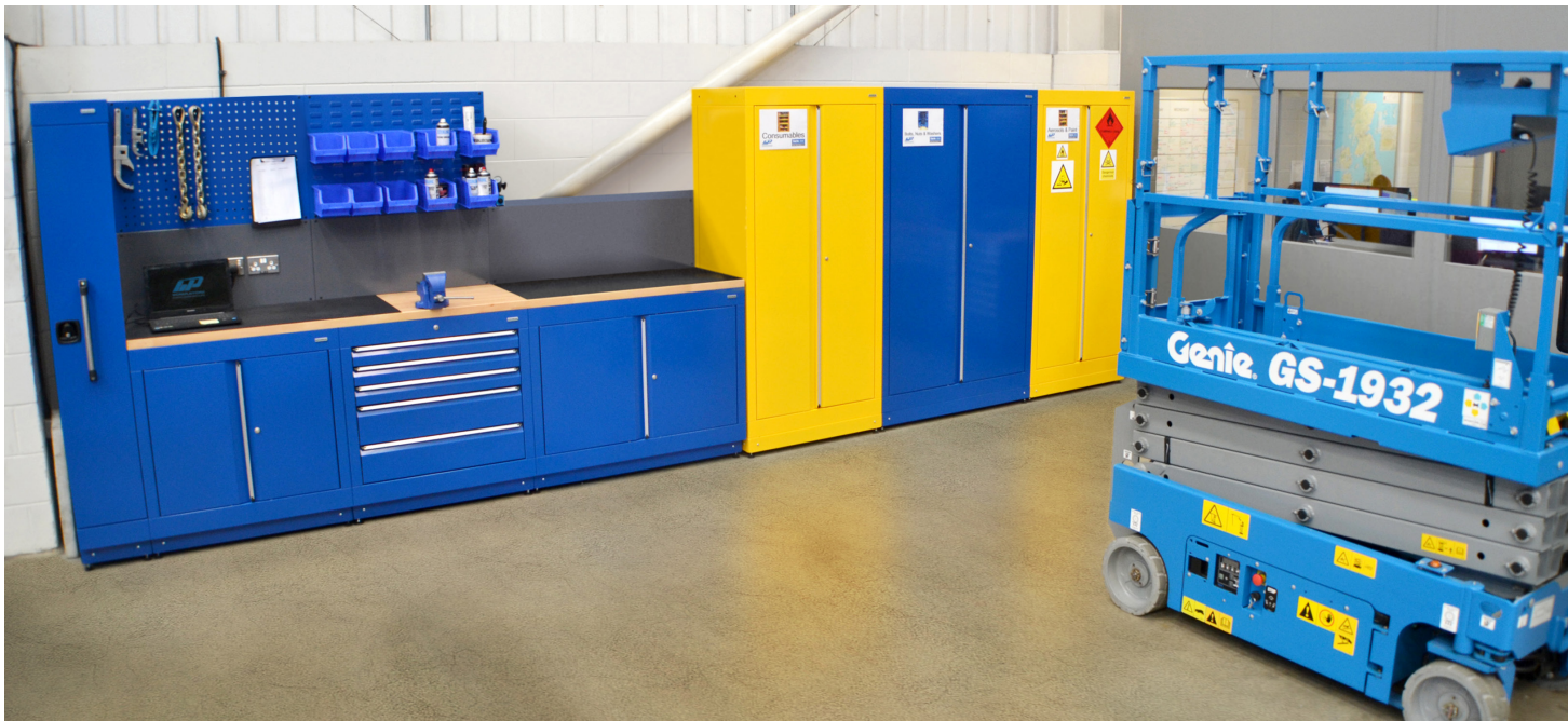
Workstations custom painted to match corporate colours and for isolating hazardous substances